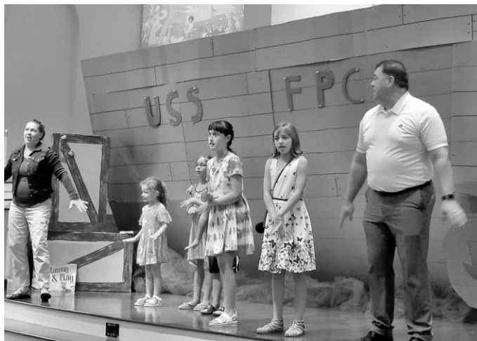
The “Thacker Family singers” present the Offertory Anthem as behind them the USS FPC signals the beginning of VBS- Shipwrecked.