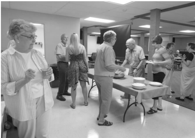
Presbees socializing last month as they waited in buffet line!