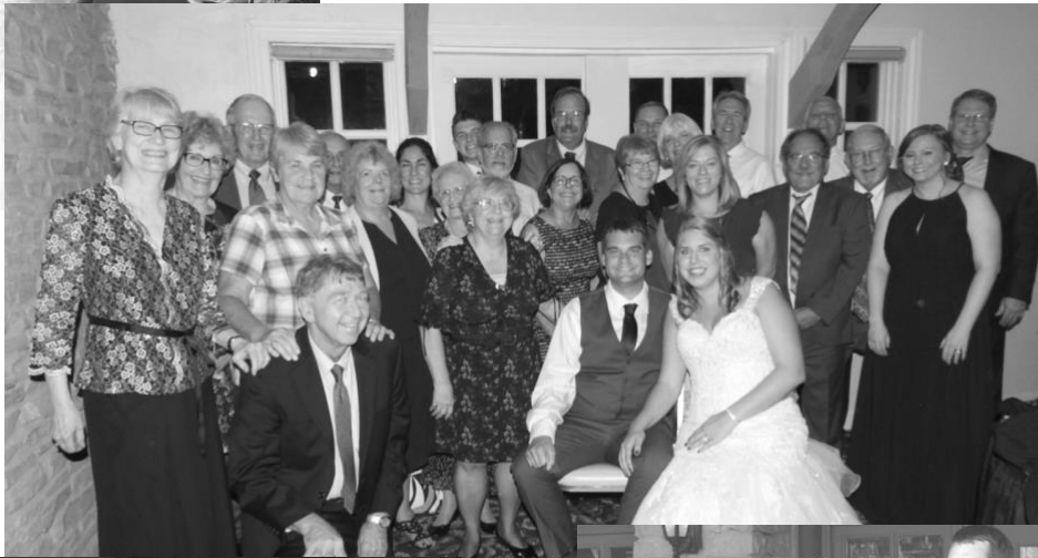
Happy FPC family and friends