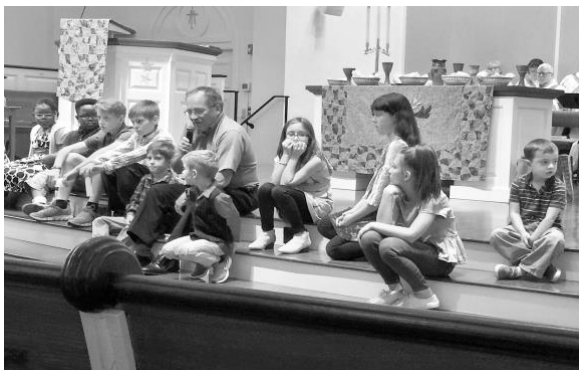
the children collecting donation bags for PIN as part of our continuing legacy of giving....