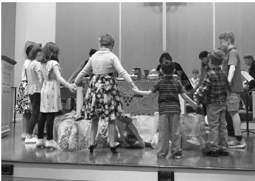
Children's Moment Prayer Circle to bless our donations to P.I.N. on World Communion Sunday.