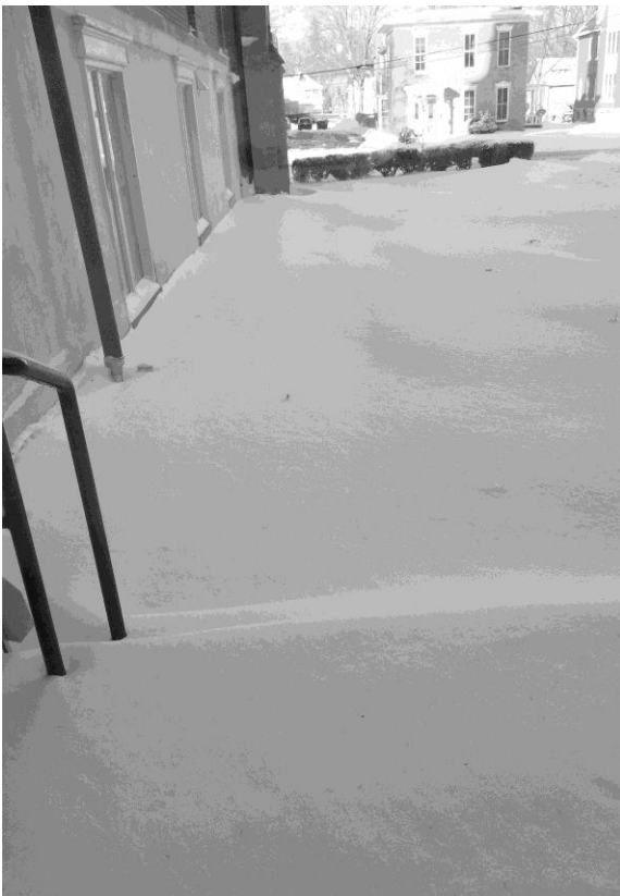
The view (from inside!) through the side front door on Sunday, January 20 th .