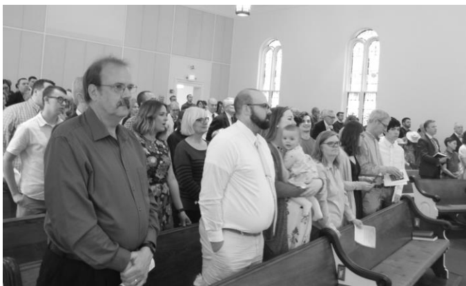
The Easter congregation proclaiming: