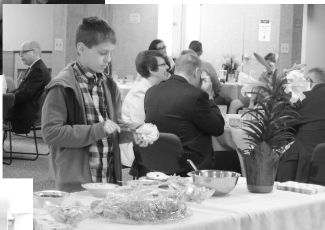
checking out the bagel bar...