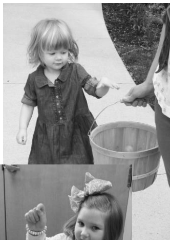
Finding the eggs....