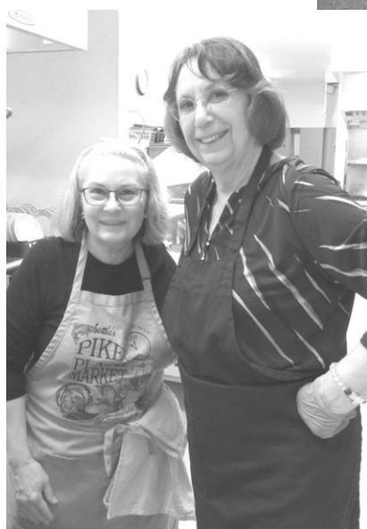
the breakfast crew...