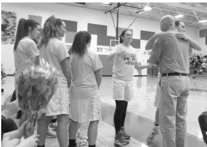
Team dedicates the night and money raised to their coach to help in his personal fight against cancer.