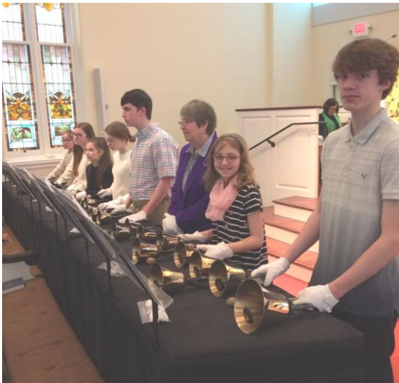
Carillon prepares All Night, All Day for the Prelude on February 24th!