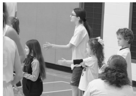
Elgin students form line to high five the team members as they are introduced!