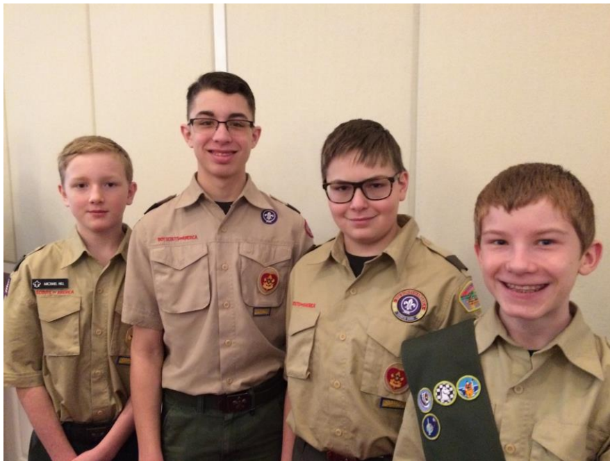
Troop 318 served as ushers, took up the offering and led the Children's Moment on February 24 th .