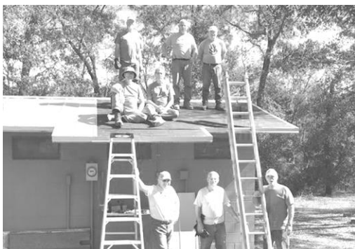
Roof crew poses with a building after they had completed the new metal roof.