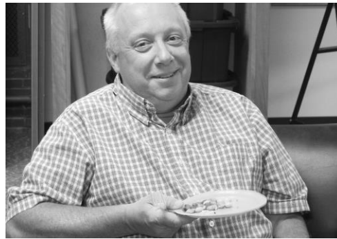
Taste tester?? Enjoying the goodies!