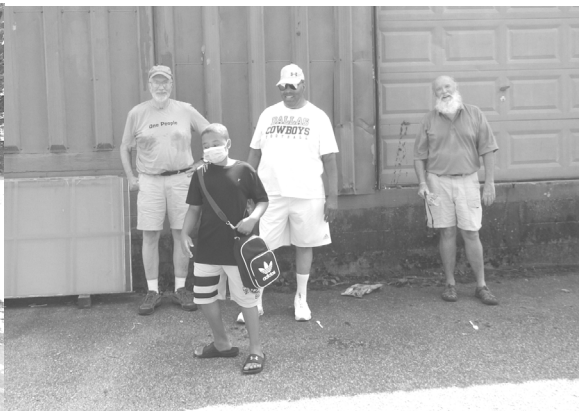
Enjoying the SHADE!