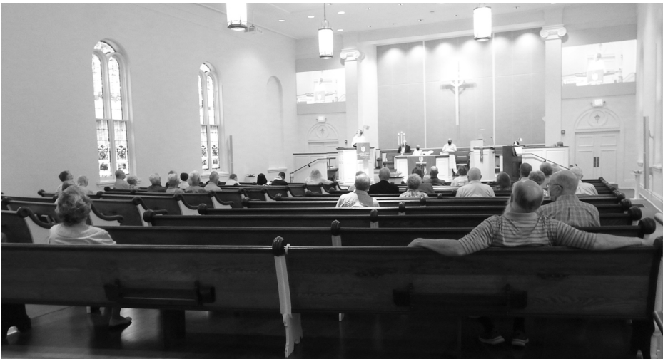
Socially distanced view of Sunday Worship on August 15 th .